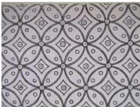
Design idea for the theme or patterns