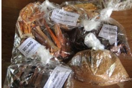
Dye, colouring the fabric made from synthetic dye or natural dye